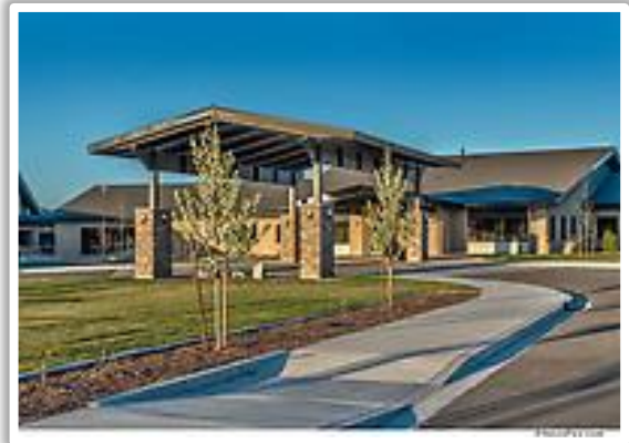
Northern Nevada State Veterans Home