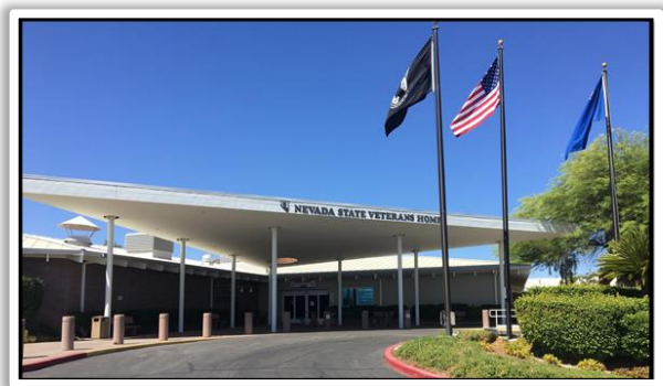
Southern Nevada State Veterans Home