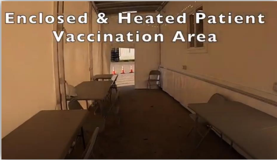
Six socially distanced vaccination stations.