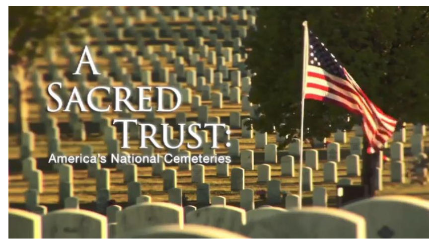
Sacred Trust Video (Run Time = 8:30) http://www.cem.va.gov/sacred.asp